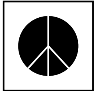
This Symbol means Death and Depravity

The human beings of today and the peace movement erroneously identify with an imaginary, incorrect peace symbol and, therefore, in truth court and evoke non-peace and death, disharmony and unkindness as well as war, elimination, destruction and everything rotten and evil. And truthfully that is because the so-called PEACE symbol used by the human beings is indeed expressing exactly the opposite of peace, harmony and life. Thus in fact it bears senseless death and elimination.